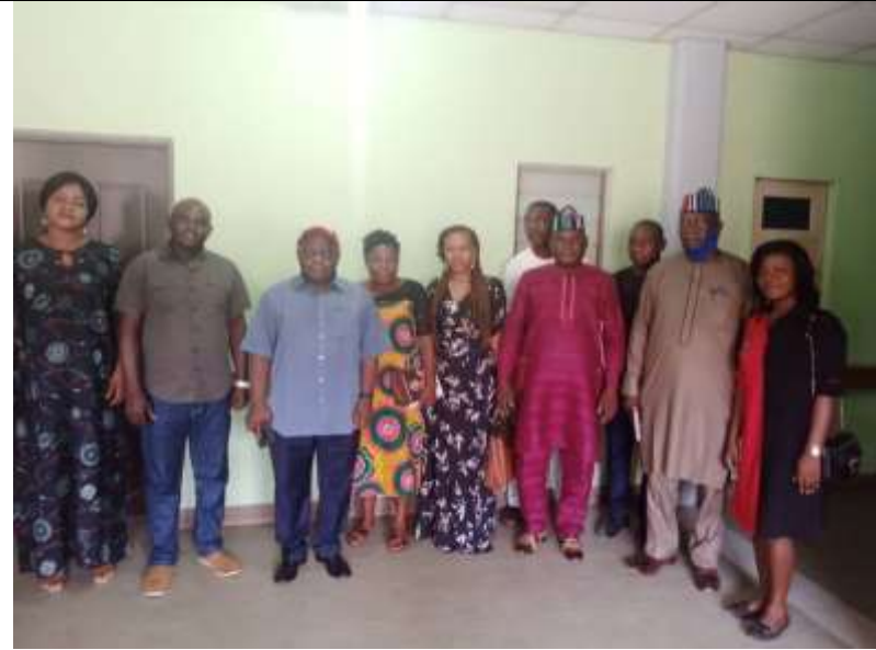
First Step's Team in a group photo with the Commissioner for Education and Directors in the Ministry during advocacy visit to the Ministry in Makurdi, Benue state