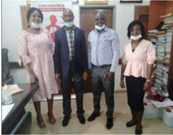
First Step's Team in a group photo with the Commissioner for Health and Human Services during advocacy visit to the Ministry