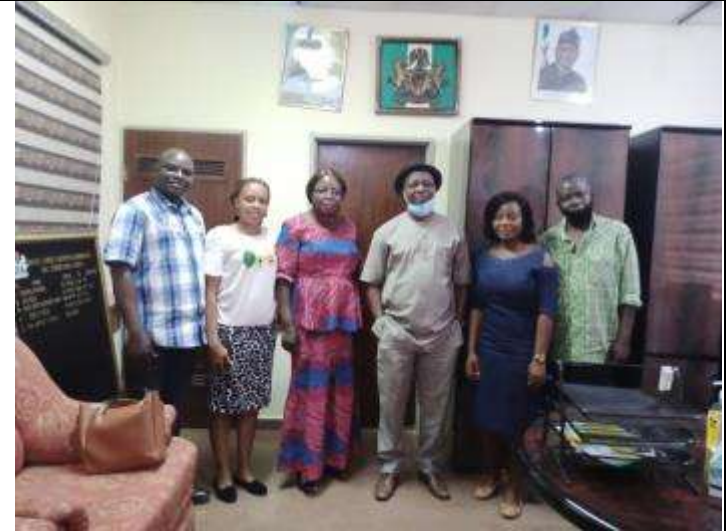
First Step's Team in a group photo with the DG & mgt staff of Benue State Planning Commission during advocacy visit to the Commission in Makurdi Benue State