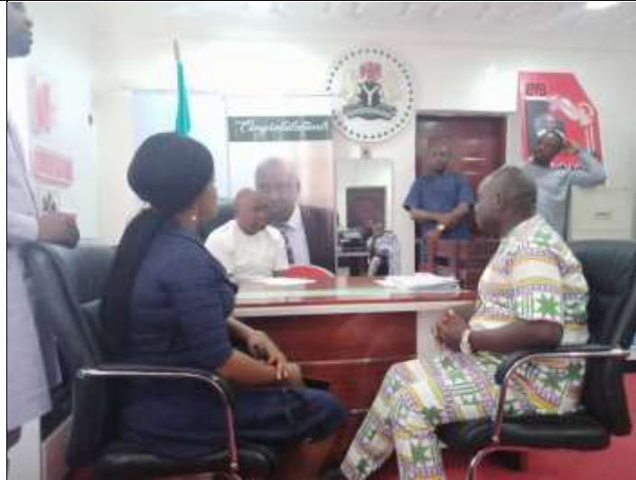
First Step's Team in a discussion with the Special Adviser to the Governor of Benue State, Bureau for Local Gov't & Chieftaincy Affairs during advocacy visit to the Bureau in Makurdi, Benue State