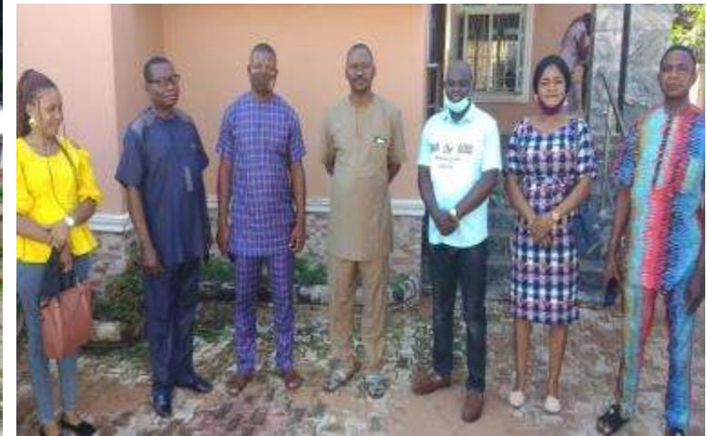
First Step's Team in a group photo with the management Benue State Primary Healthcare Board